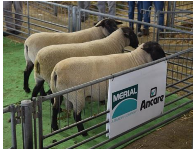
Ram Hogget Food & Fibre Trifecta - 3 Ram Hoggets