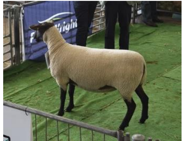
'Miss Canterbury' Little River 47/15