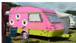
ROYAL WELSH SHOW 2017